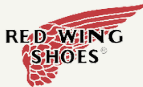
Red Wing Shoes